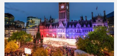
Greater Manchester, UK