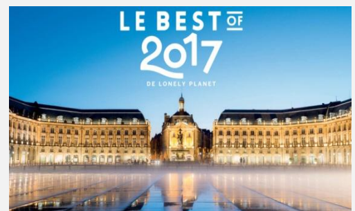
Bordeaux, France Site of the 2017 ICSA International Conference